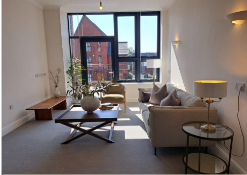
Typical living area