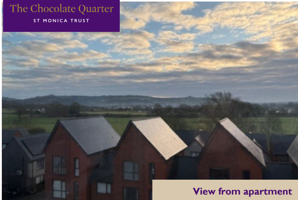
View from apartment