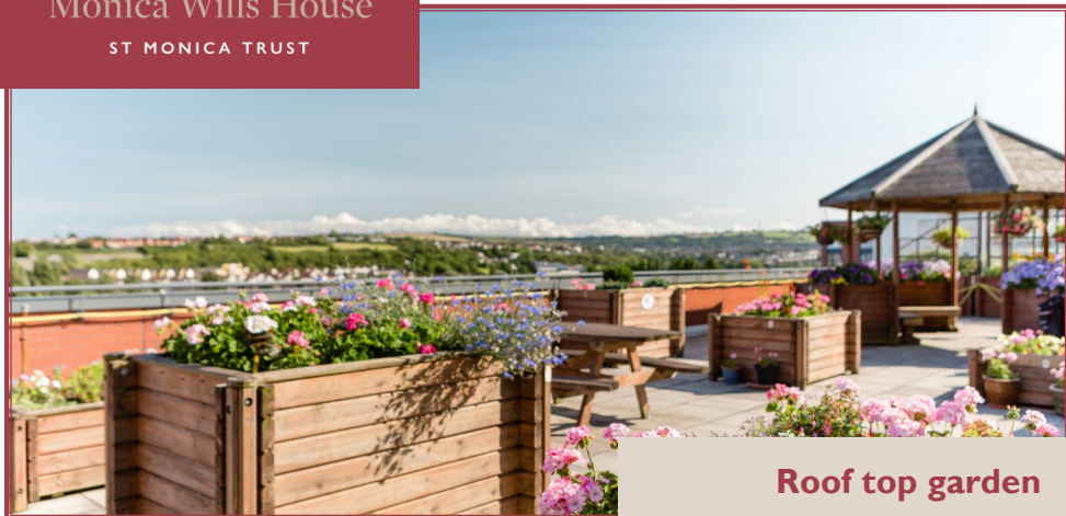
Roof top garden