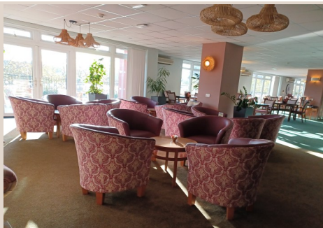
Resident's Coffee Lounge