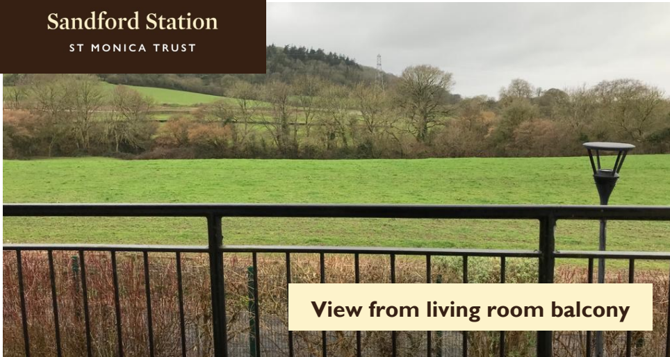
View from living room balcony