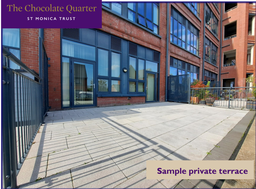
Sample private terrace