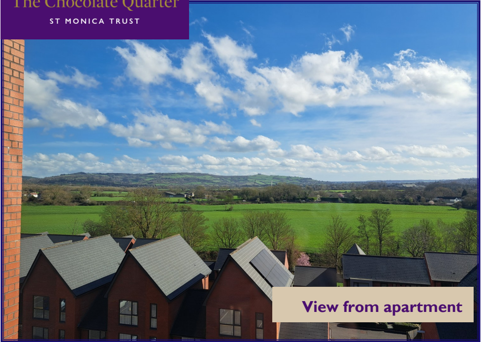
View from apartment