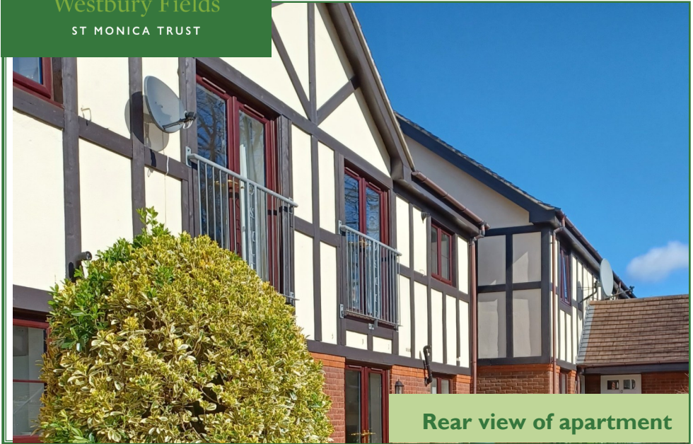
Rear view of apartment