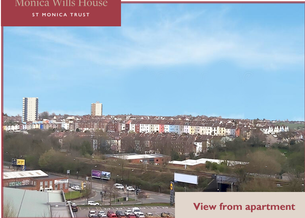
View from apartment