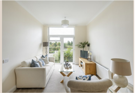
Living room example