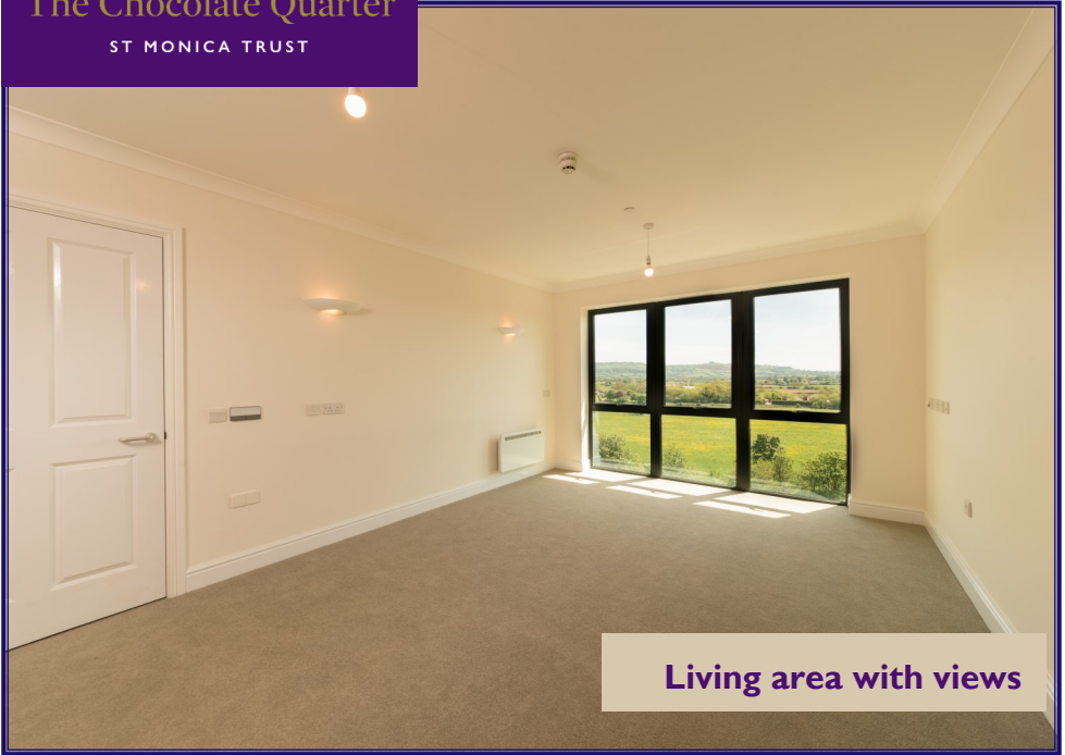
Living area with views