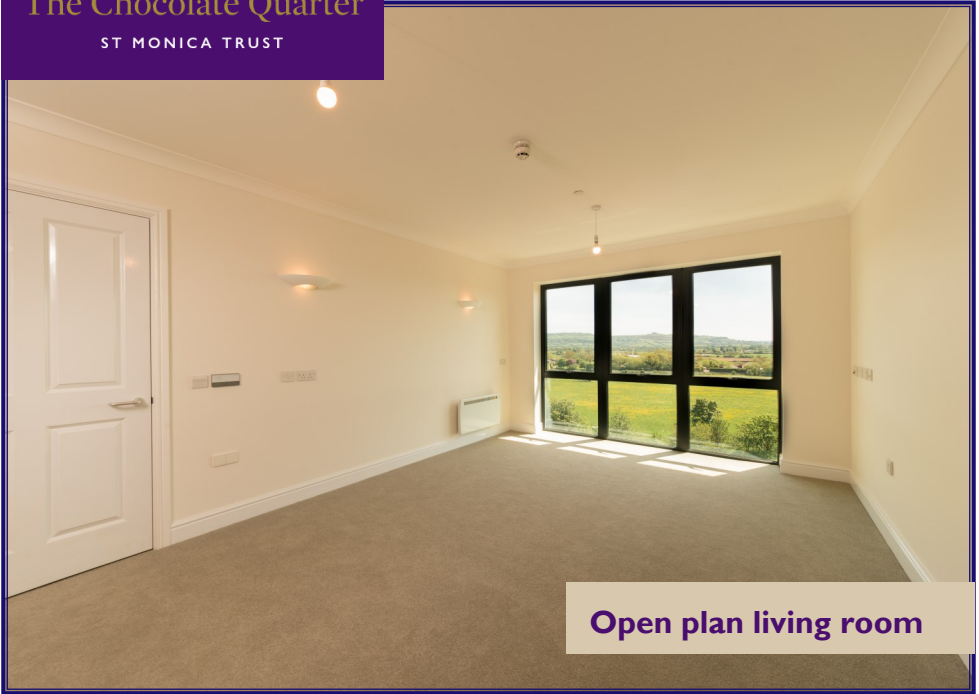
Open plan living room