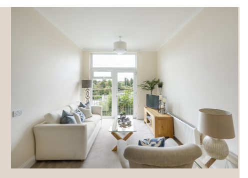
Typical Living Room