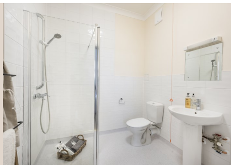
Typical shower room