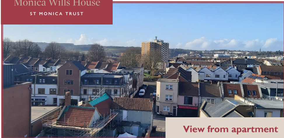
View from apartment