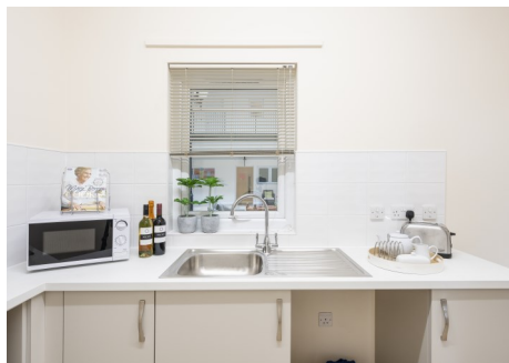
Typical kitchen style