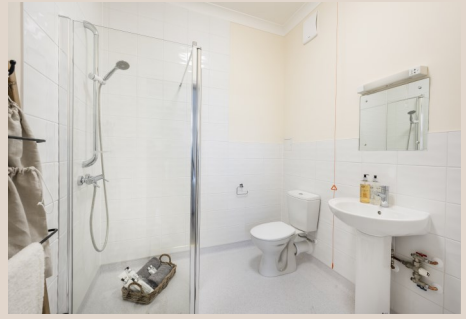
Typical shower room