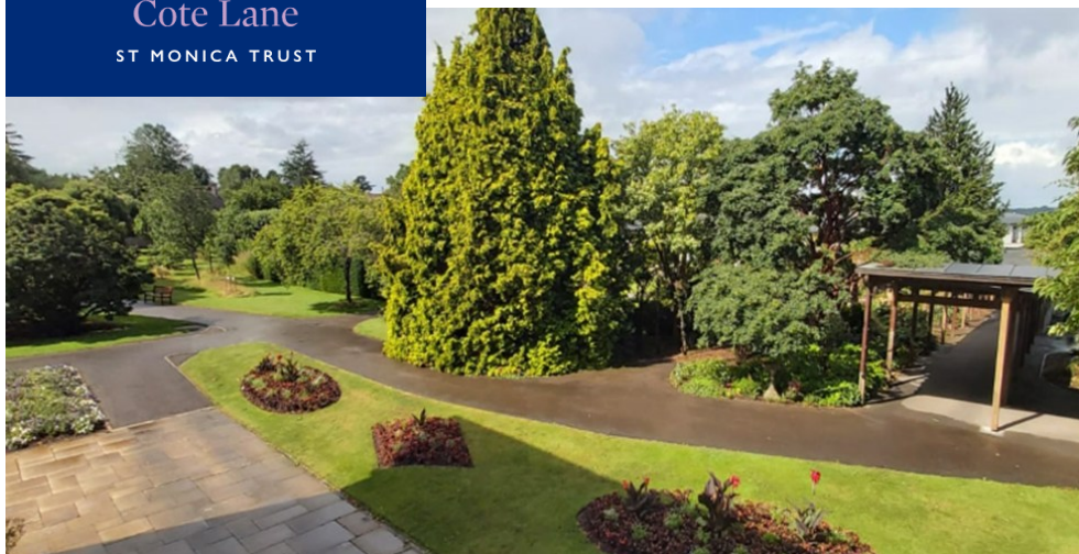
View from apartment