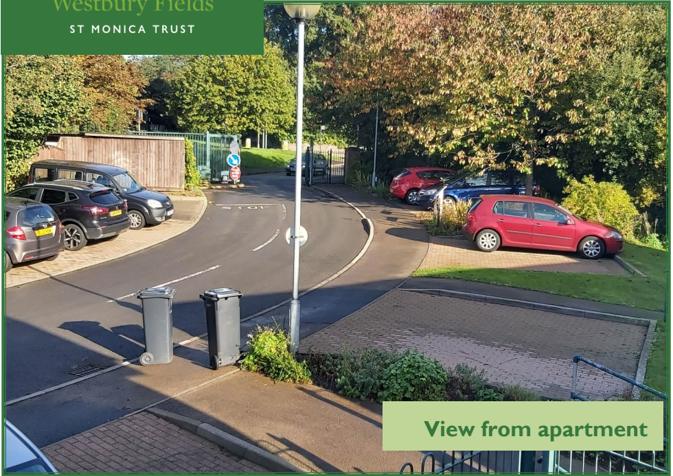
View from apartment