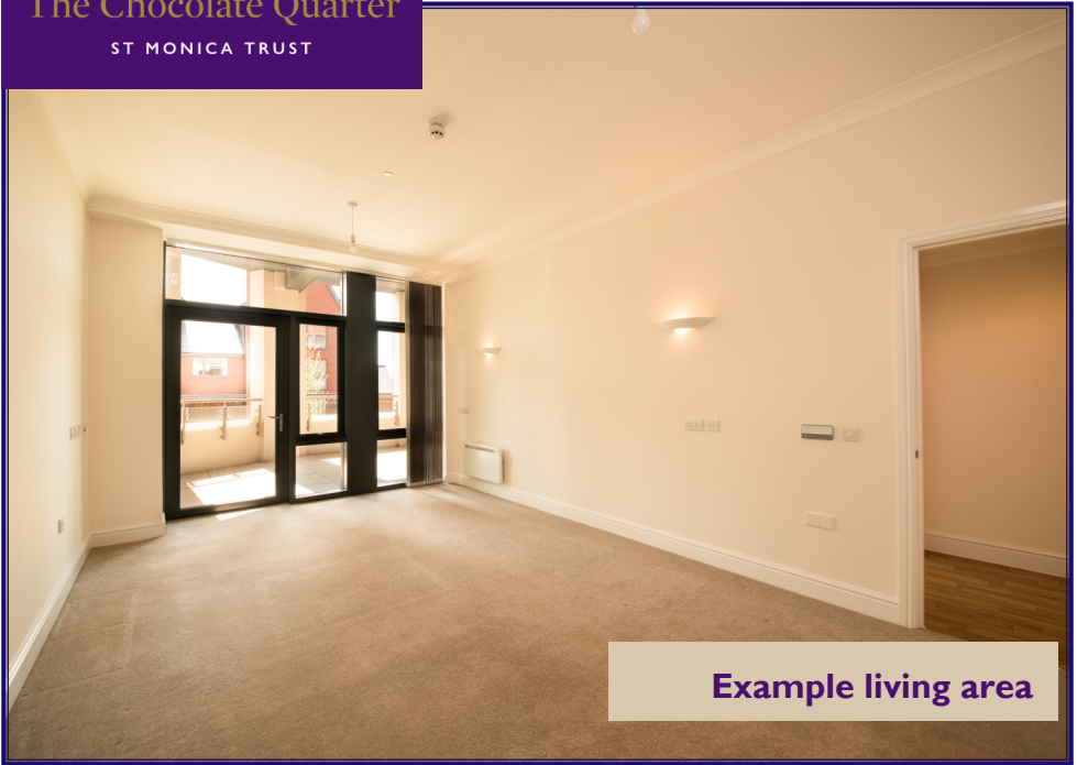
Example living area