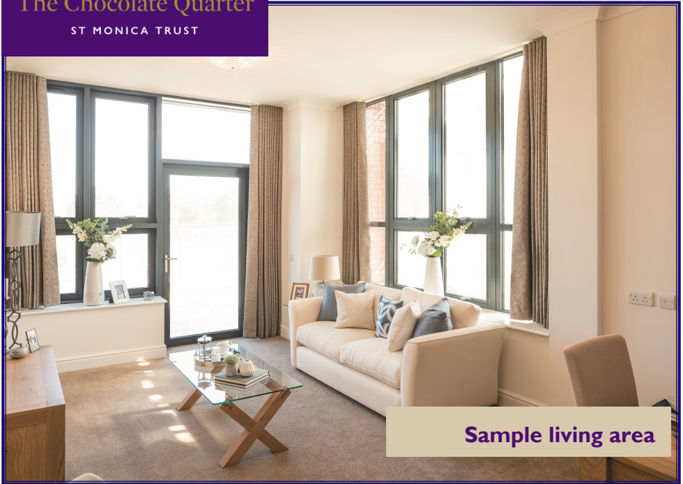
Sample living area