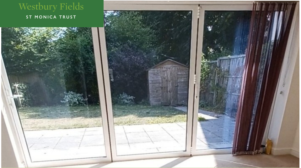
View from living room