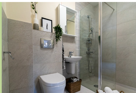
Typical shower room