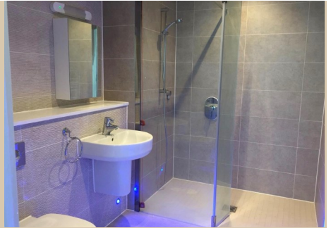
Typical shower room