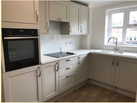
Typical new kitchen