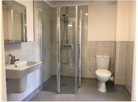
Typical shower room