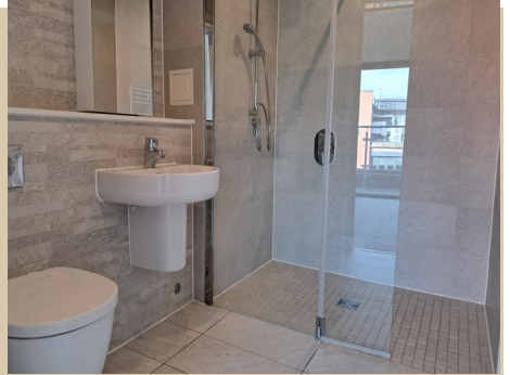
Typical shower room