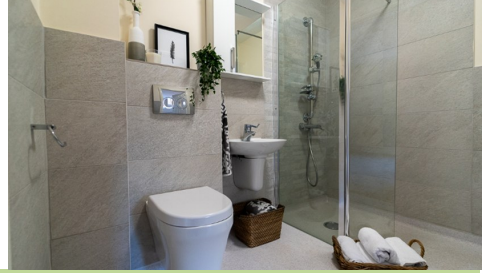
Typical shower room