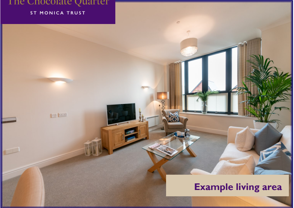
Example living area