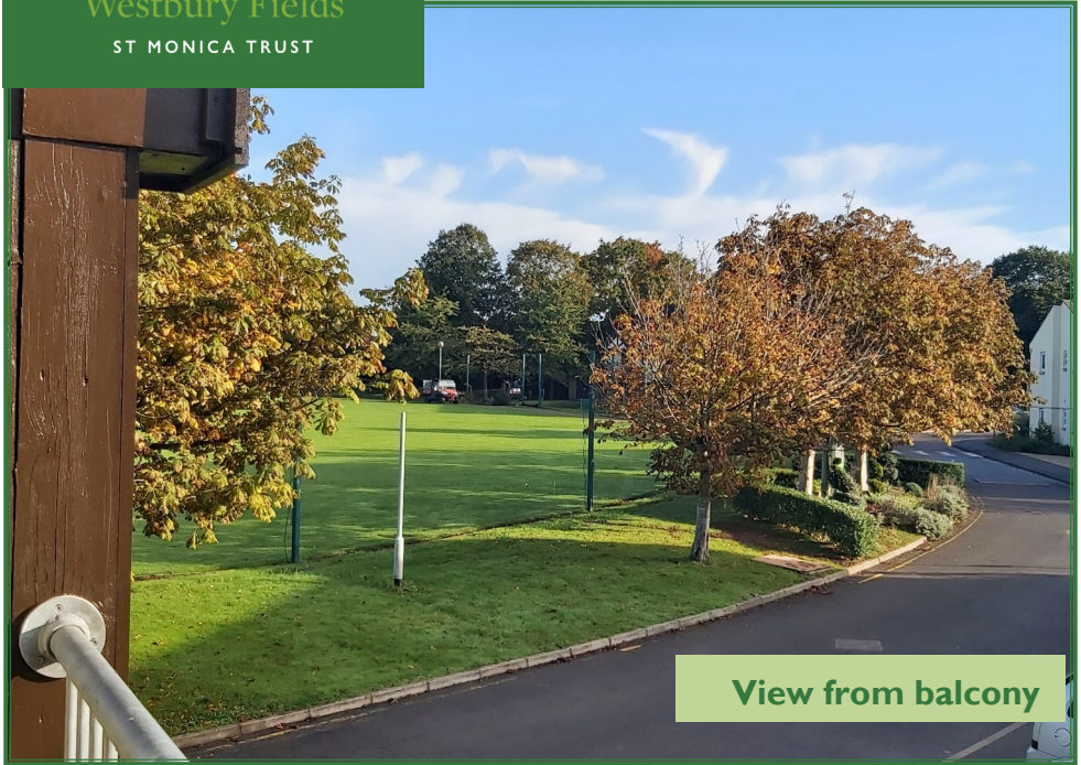
View from balcony