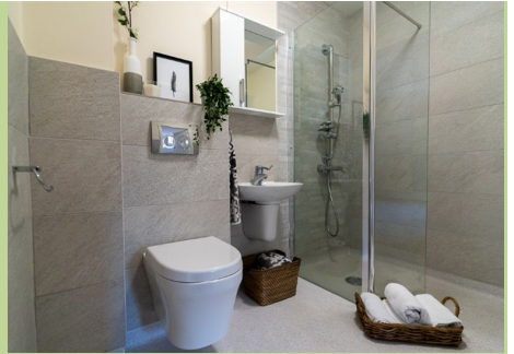
Typical shower room