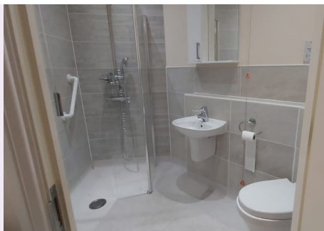
Typical shower room