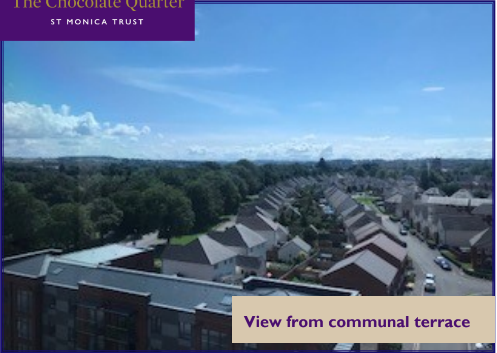
View from communal terrace