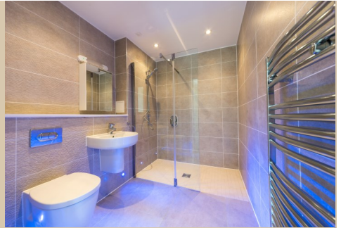
Typical ensuite shower room