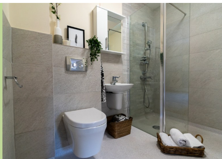
Typical shower room