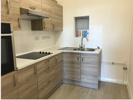
Example of kitchen