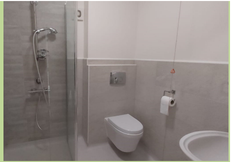
Typical Shower room