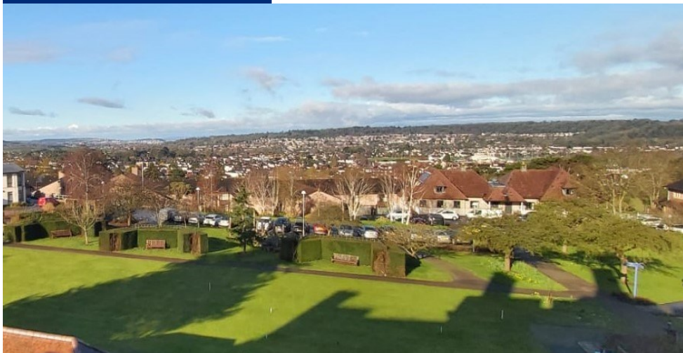
View from apartment