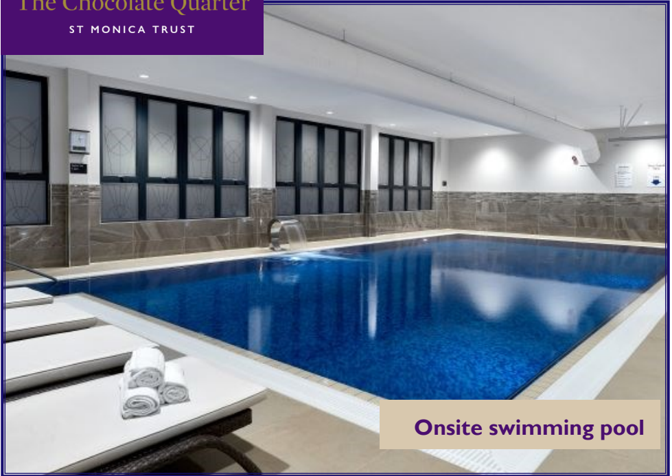
Onsite swimming pool