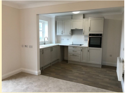
Example of open plan living