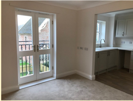
Example of Juliette balcony