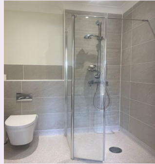
Typical ensuite shower room