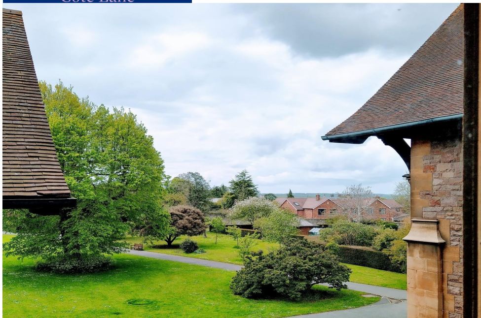
View from apartment