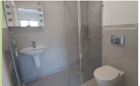
Typical shower room