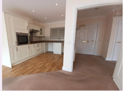
Kitchen and hallway