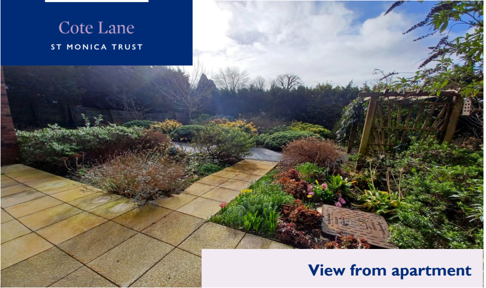
View from apartment