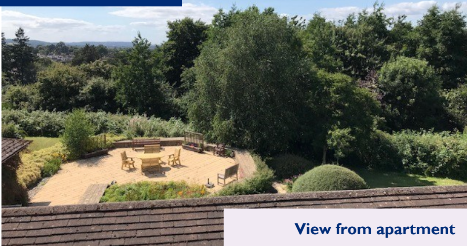
View from apartment