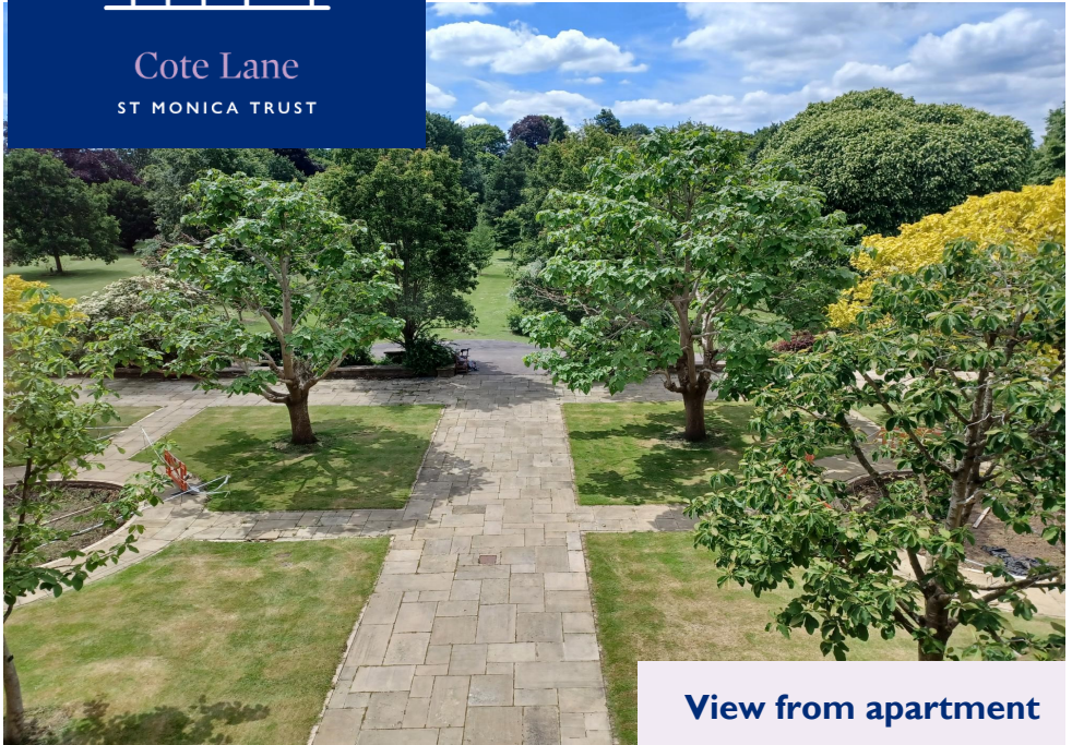
View from apartment