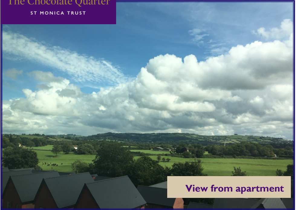
View from apartment