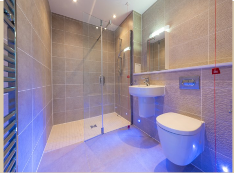
Typical shower room