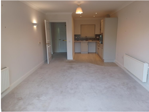
Living kitchen diner