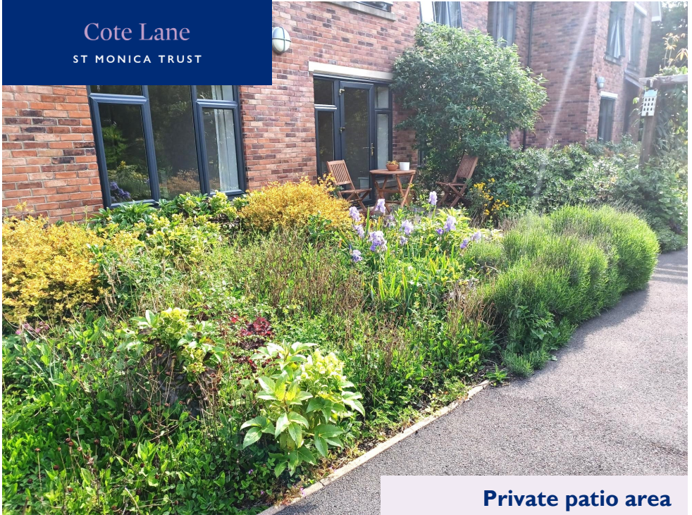
Private patio area