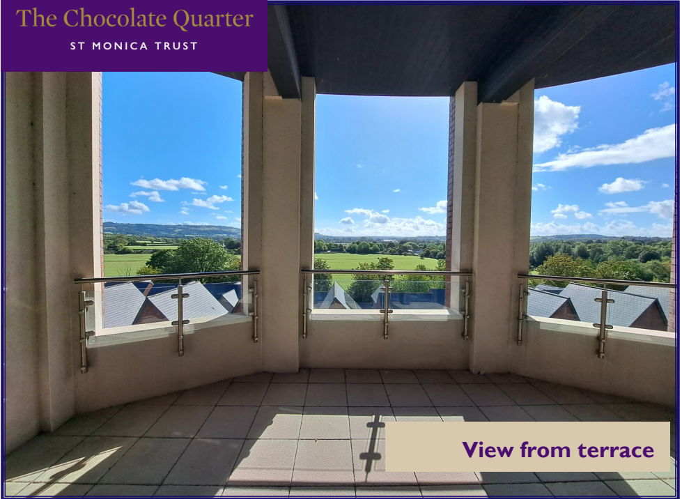
View from terrace