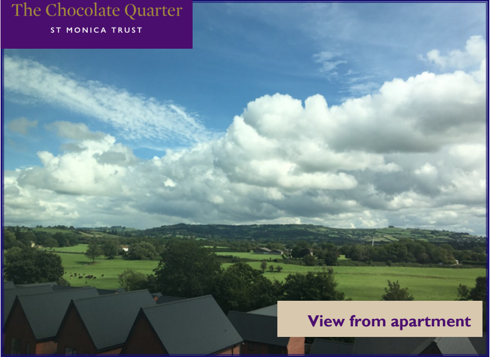
View from apartment