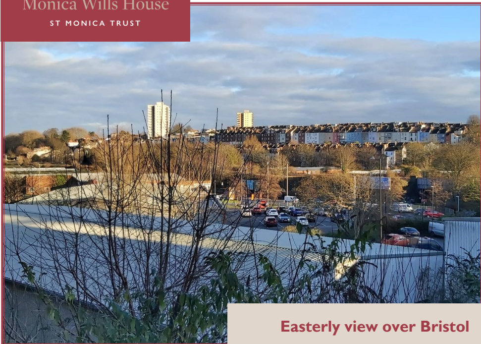
Easterly view over Bristol