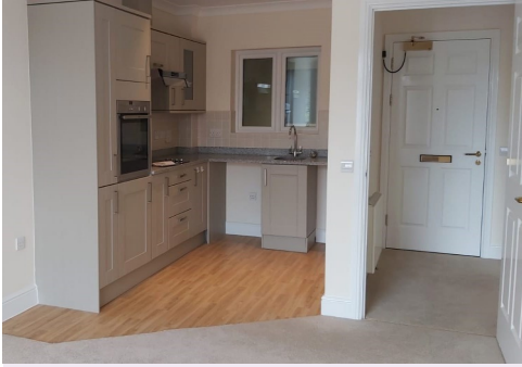
Kitchen living room