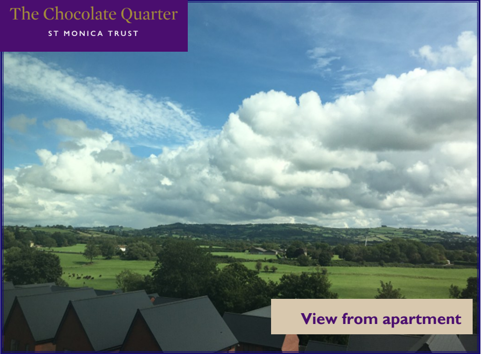
View from apartment