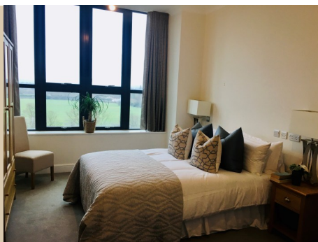
Typical Bedroom 1