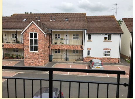
View from front balcony