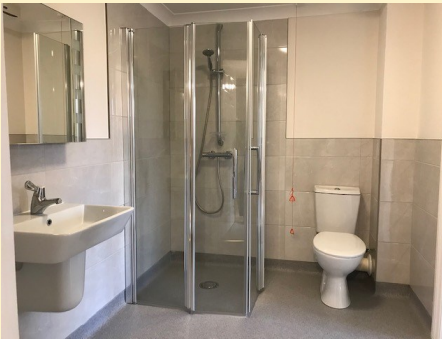
Typical main ensuite