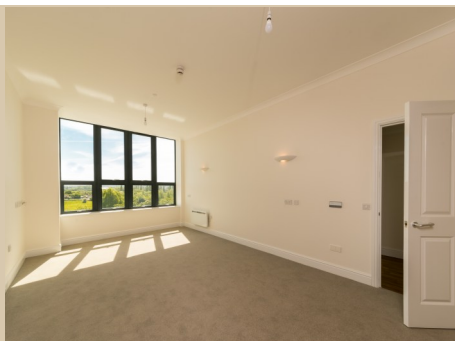
Typical living area