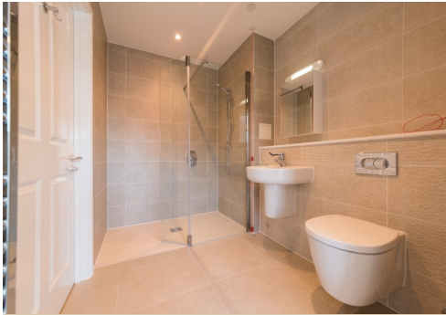
Example shower room