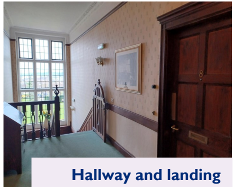
Hallway and landing

Please call the sales team to book on 0117 949 4004