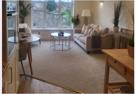
Lounge and Kitchen